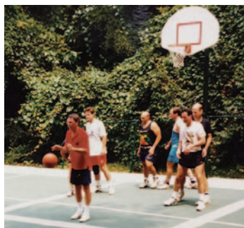
'67ers at work on the court