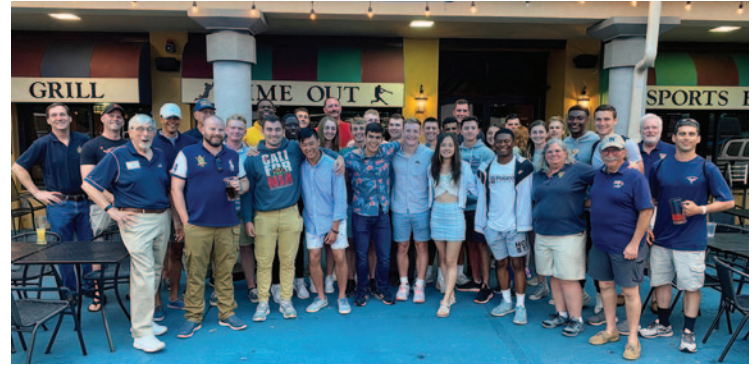
Hampton Roads Chapter: "Meet and Greet" with YP Summer Training Block 1 Midshipmen