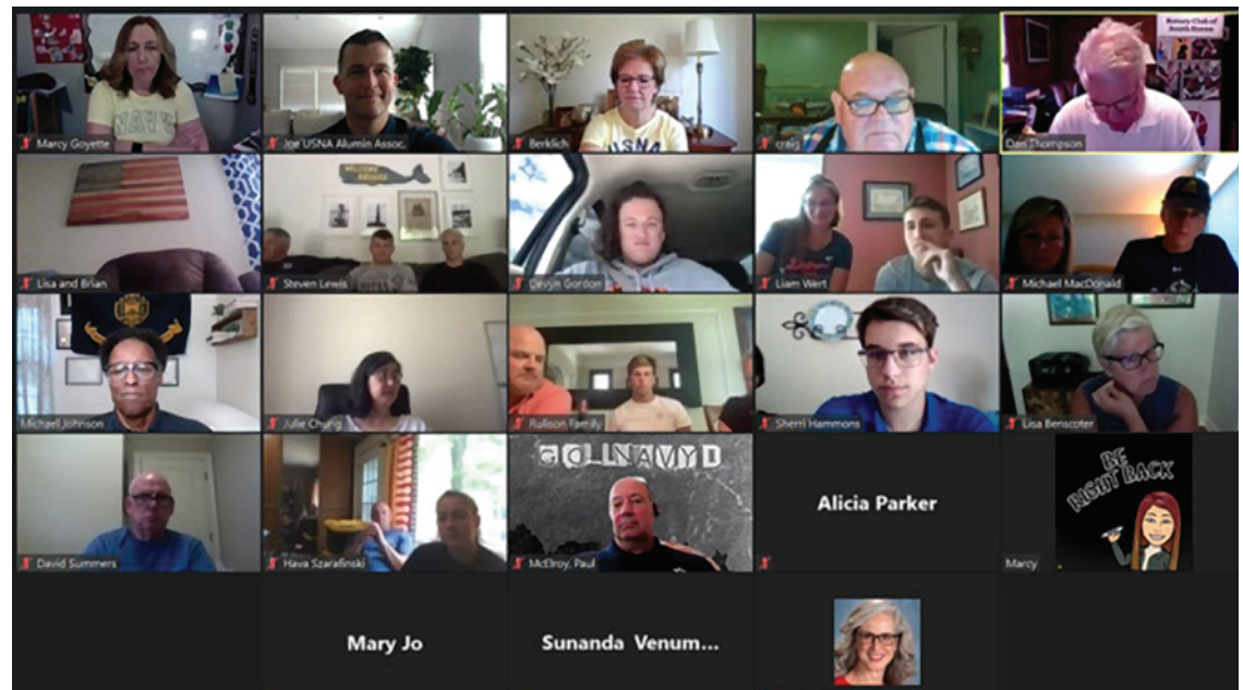
Detroit Chapter: The USNA Parents Club of Michigan hosted a virtual Welcome Aboard for the new Michigan midshipmen.