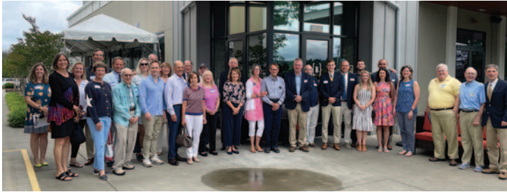
Cebtrak Vurgini Chapter: Central VA Alumni and Support Team