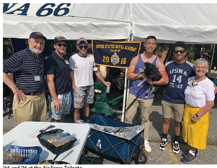
'66 and '16 at the Air Force Tailgate

And that wraps up this issue. Many thanks to all who submitted items. Stay well! Until February... All the best...Mike!!!