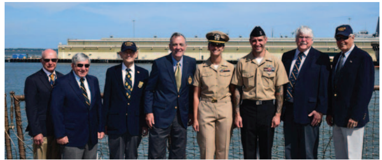
'66ers Attending GONZALEZ Leadership Awards