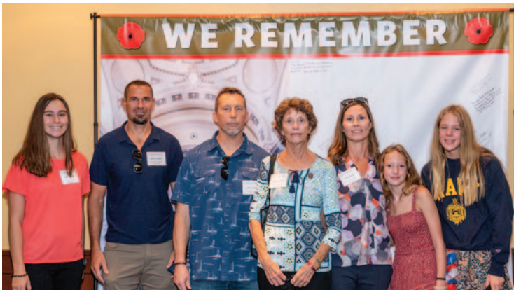
'66: Buckley Family