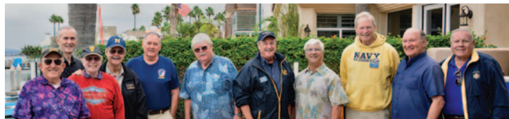
'67: The Legends (In Their Own Minds) at Hapke's