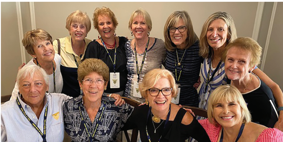
'66 SOS REUNION GATHERING